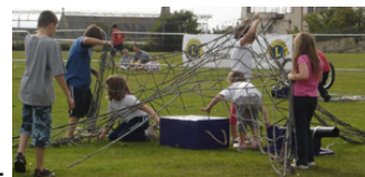
Under the Net

Bohemia Road on Saturday 27 th September. The idea of the tournament is for teams of six to pull a 'mock' Gun-Carriage around the course, taking it apart and reassembling it to go over, under or through obstacles on route. Hastings Gun-Carriage Group currently has three mock Gun-Carriages which are used for the event and also for competitors' pre-event training.