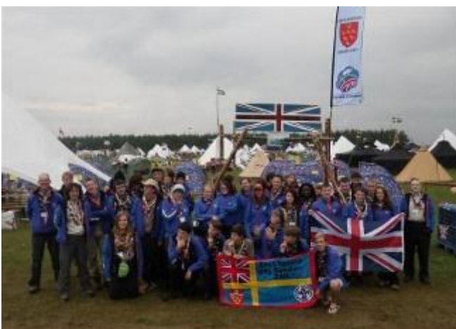
Some of our Group visiting a Swedish Camp