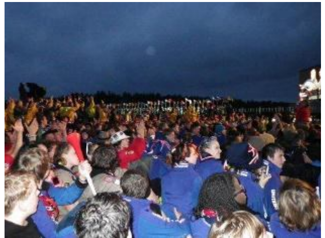
The Opening Ceremony.