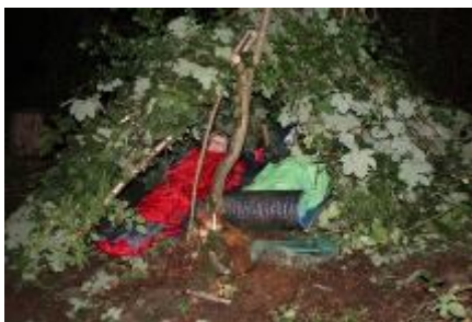
Sleeping in the shelter

Seven Westfield Scouts gathered at the Scout hut in the pouring rain to collect up some equipment for a survival skills camp. With everyone dressed in their waterproofs we set off to the field, unloaded kit and said goodbye to their parents. It was at this point that the rain stopped and apart from brief showers held off to the end of camp – what a relief!