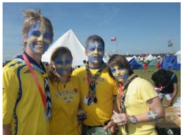
Some Swedish Scouts!