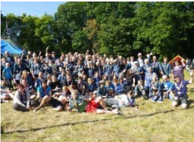
Our Group just before opening ceremony