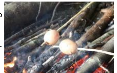
Cooking eggs on a stick

After taking down their shelters they all headed for home with trophies, such as rabbit skins, knives carved from wood or fishing spears, for a bath and a good night's sleep.