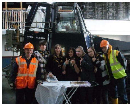
Ironing the Lifeboat?

Extreme Ironing is where you get into teams and take an iron, ironing board and a shirt to the Old Town and iron in the strangest and most creative places. We also had to take pictures for proof. The most popular place to iron was the Life