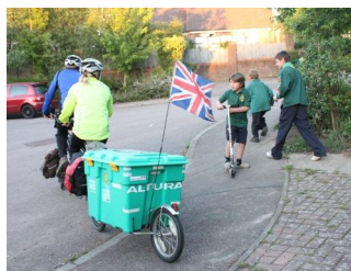
Setting Off Again